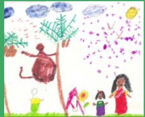
- Bhavani Somarshakar, Grade 1