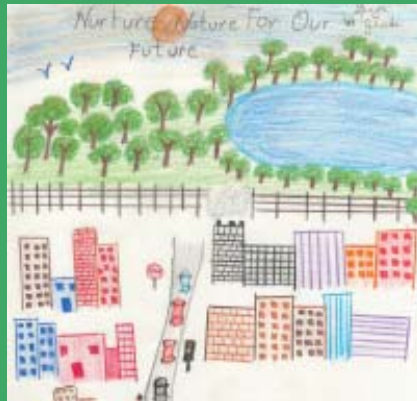
- Divya Natesan, Grade 6