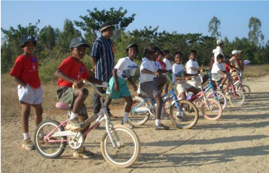
Lining up for the Grade 4 bicycle race at the 2006 Shanti Bhavan Sports Day