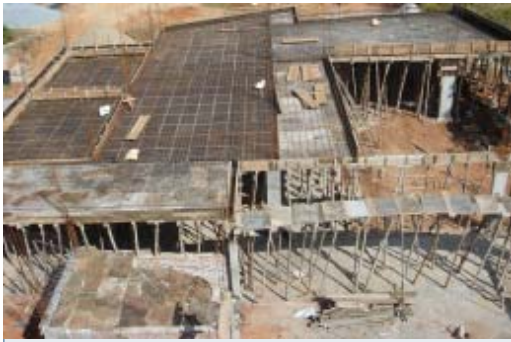
School building extension in progress