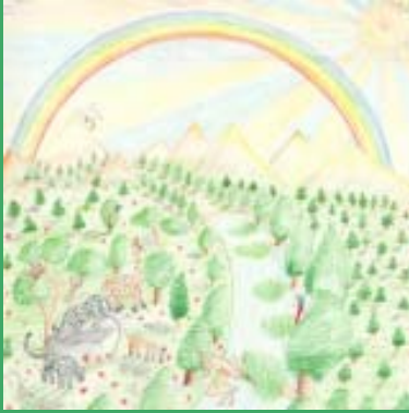
- Clement Abilash, Grade 7